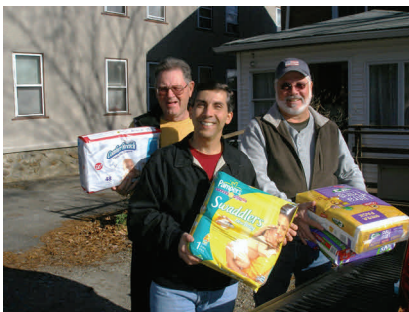
Members from St. Teresa Men's Club in Woodbury deliver diapers from their Christmas collection.

During the Advent Season we were truly blessed by the generosity of so many people and organizations. We are sincerely grateful for every donation, large or small, that we received. This enabled us to distribute Christmas gifts to many of our moms for their babies, as well as helping to restock our items to use for new clients. We are grateful to the following parishes and organizations: Watertown Ecumenical Council, Watertown Methodist Church, Our Lady of Loreto CCD Class, IBM, St. Mary Magdalen -Oakville, St. Matthew-Forestville, Blessed Sacrament Pre-school-Waterbury, Our Lady of Grace-Bantam, Church of the Nativity-Bethlehem, SS Peter and Paul-Waterbury, The Immaculate Conception-Harwinton, St. Francis Xavier-Waterbury, The Basilica of the Immaculate Conception-Waterbury, Soroptomists, Inc.-Waterbury Branch, St. Teresa Men's Club-Woodbury, St. Ann-Bristol, and 3 individuals who were "Santa" for three of our clients. We apologize if we inadvertently neglected to acknowledge an organization. Please know that we say THANK YOU to all of our supporters.