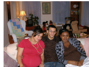
Clients from EWYL program

Three nursing students from St. Joseph College, W. Hartford, have been putting together a self respect workshop for some of our clients as a part of their community outreach. We also have four dental hygiene students from Tunxis Community College in Farmington, working with us. They will provide a presentation to our EWYL parents on good oral hygiene during pregnancy and for their newborn. Volunteers and staff continue to "walk the talk" whether it be taking a young mother whose car died to a pediatrician appointment, going through labor and delivery with a client who has no support,